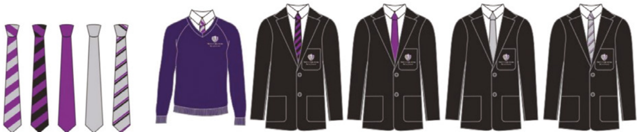
2024-25 Academic Year

Our Pupils wear a tie that corresponds to their year group. Pupils will wear the same tie throughout their time at Nottingham Academy. The tie remains with the year group.